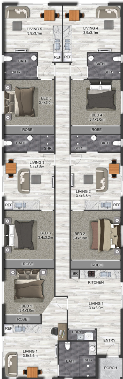
Plan Name: Hayman